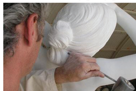
Design Studio in Bottega Traineeship of Sculpture/Photography or Painting in real Bottega d'Arte July 29/August 10