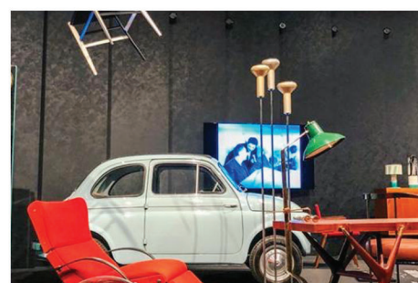
Italian Design 42 contact hours July 15/July 27