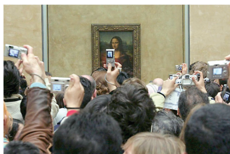
Art and Media 42 contact hours July 15/July 27