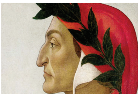
Italian Language for Foreigners 42 contact hours July 15/August 10