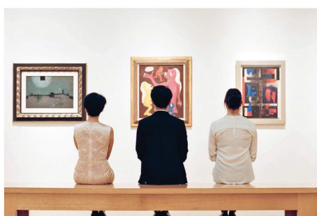
The Business of Art 42 contact hours July 1/July 13